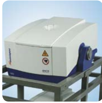
minispec Magnet on Cart for vertical and horizontal Access