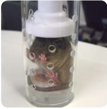
Animal Restrainer with animate Mouse