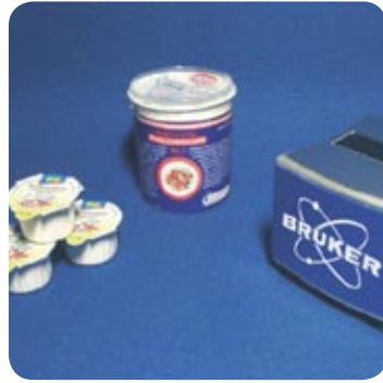
In-package food analysis